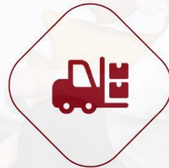
Warehousing / 3PL