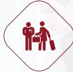
Hotels and Stay Solutions